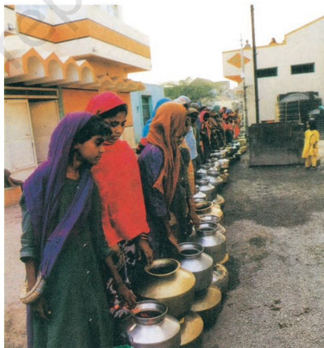
Fig. 3.1: Water Scarcity

एक ओर इजराइल जैसे 25 सेमी. औसत वार्षिक वर्षा वाले देश में जल का कोई अभाव नहीं है तो दूसरी ओर 114 सेमी. औसत वार्षिक वर्षा वाले हमारे देश में प्रति वर्ष किसी भाग में सूखा अवश्य पड़ता है। देश में जल की उपलब्धता और उसके स्वरूप के अनुसार समुचित जलप्रबंधन न होने के कारण ही वर्षा का जल नदी-नालों में तेजी से बहकर समुद्र में चला जाता है जिससे वर्षा के बाद के लगभग नौ महीने देश के लिए पानी की कमी के होते हैं। ये ही मूल कारण हैं देश में जलीय अभाव के, जिसे हम उचित प्रबंधन के द्वारा ही नियंत्रित कर सकते हैं।