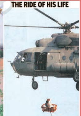
UP UP & AWAY An UAF helicopter rescues a worker who was trapped in the floodwaters of the Taxi river in Jammu on Thursday