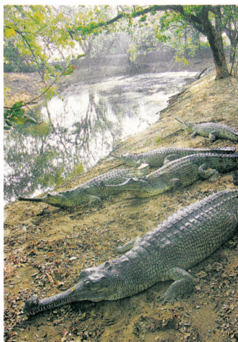
CRITICALLY ENDANGERED: Captive gharial at the Madras C

W ISPY tendrils of mist rise delicately from the water surface, tinged gold by the dawn. Your breath hangs as little clouds of vapour as you gaze upon the Girwa River on a cold winter morning. A trio of hollow clapping sounds from the other side of the river, half a kilometre away tells you that an adult male gharial is advertising his presence. It is the height of the breeding season. The place seems trapped in a time in early history when man was still clad in animal skins. It is only as the sun rises higher and burns the mist off the water that the world comes into focus with appalling clarity. The five-km stretch of the Girwa River in Katarniaghat Wildlife Sanctuary is one of the only three wild breeding sites left in the world for the most unique of all the