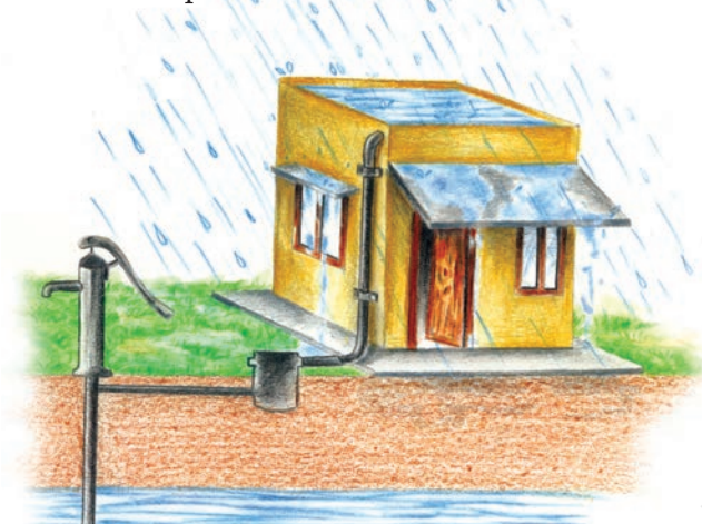
(a) Recharge through Hand Pump

system and were built inside the main house or the courtyard. They were connected to the sloping roofs of the houses through a pipe. Rain falling on the rooftops would travel down the pipe and was stored in these underground 'tankas'. The first spell of rain was usually not collected as this would clean the roofs and the pipes. The rainwater from the subsequent showers was then collected.