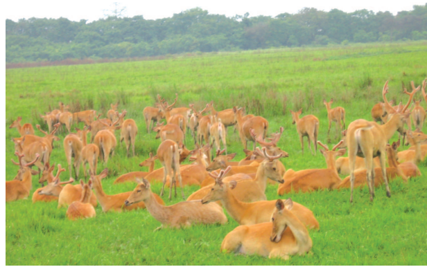
Fig. 2.2: Rhino and deer in Kaziranga National Park

equal importance as a means of preserving biotypes of sizeable magnitude. Corbett National Park in Uttarakhand, Sunderbans National Park in West Bengal, Bandhavgarh National Park in Madhya Pradesh, Sariska Wildlife Sanctuary in Rajasthan, Manas Tiger Reserve in Assam and Periyar Tiger Reserve in Kerala are some of the tiger reserves of India.