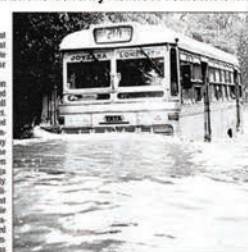
BARRELY AHEAD: A bus is stuck in a waterlogged street in Kolkata on Friday

Collect information about flood prone areas of the country