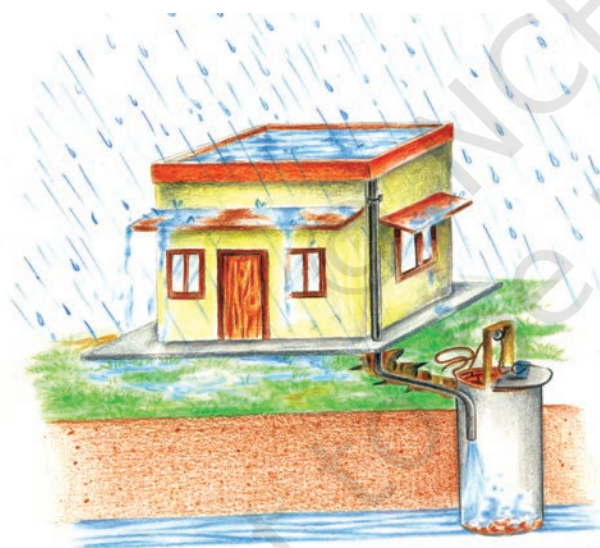
(b) Recharge through Abandoned Dugwell