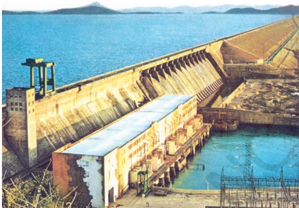
Fig. 3.2: Hirakud Dam

What are dams and how do they help us in conserving and managing water? Dams were traditionally built to impound rivers and rainwater that could be used later to irrigate agricultural fields. Today, dams are built not just for irrigation but for electricity generation, water supply for domestic and industrial uses, flood control, recreation, inland navigation and fish breeding. Hence, dams are now referred to as multi-purpose projects where the many uses of the impounded water are integrated with one another. For example, in the Sutluj-Beas river basin, the Bhakra – Nangal project water is being used both for hydel power production and irrigation. Similarly, the Hirakud project in the Mahanadi basin integrates conservation of water with flood control.