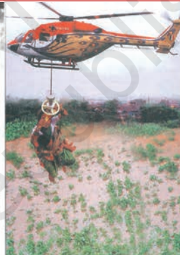
Life off An UAF helicopter rescues a woman and her child from the Dongangon village of Maharashtra's Hingoli district. In all, 11 choppers were pressed into rescue operations across the state (Related reports on P)