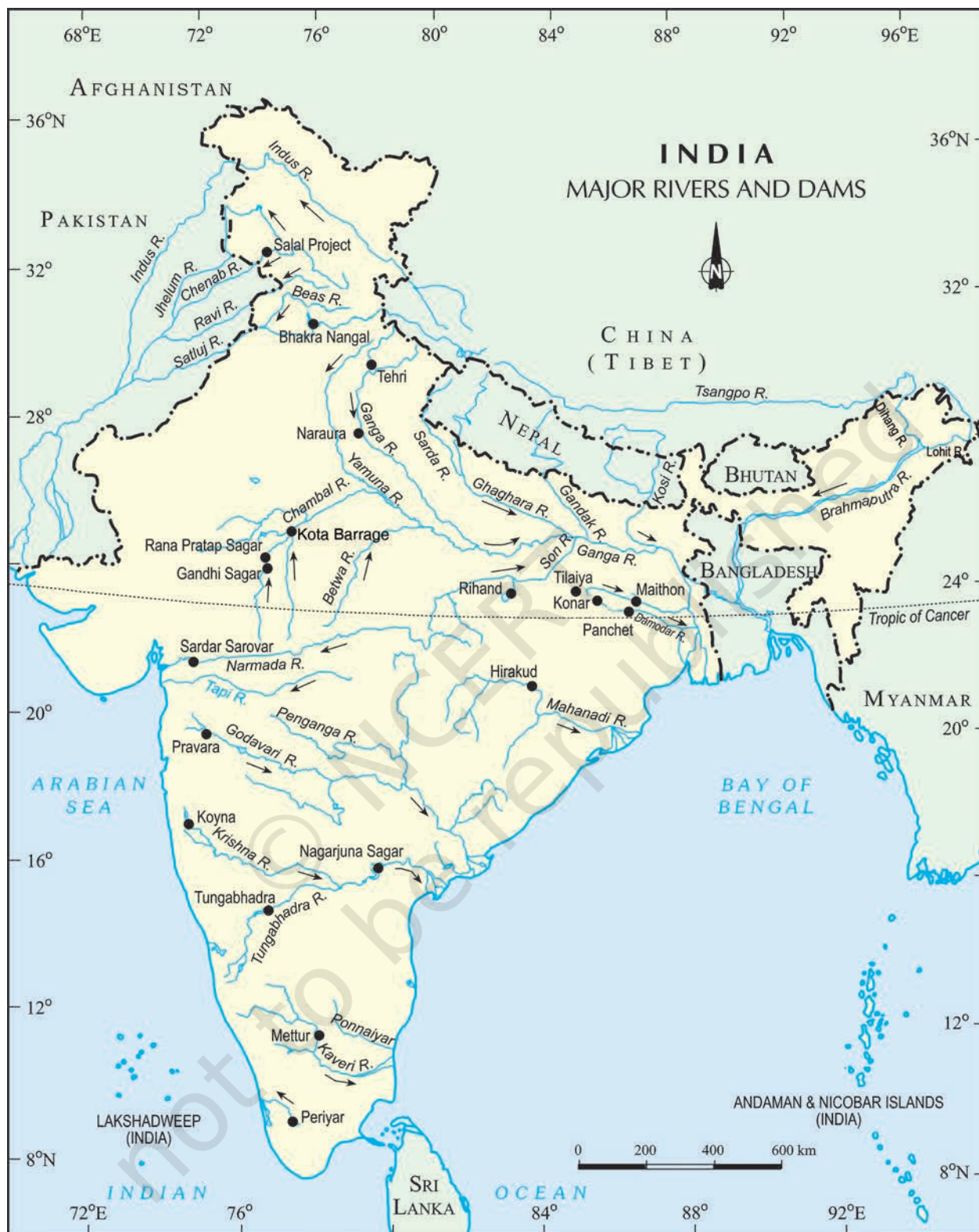
India: Major Rivers and Dams